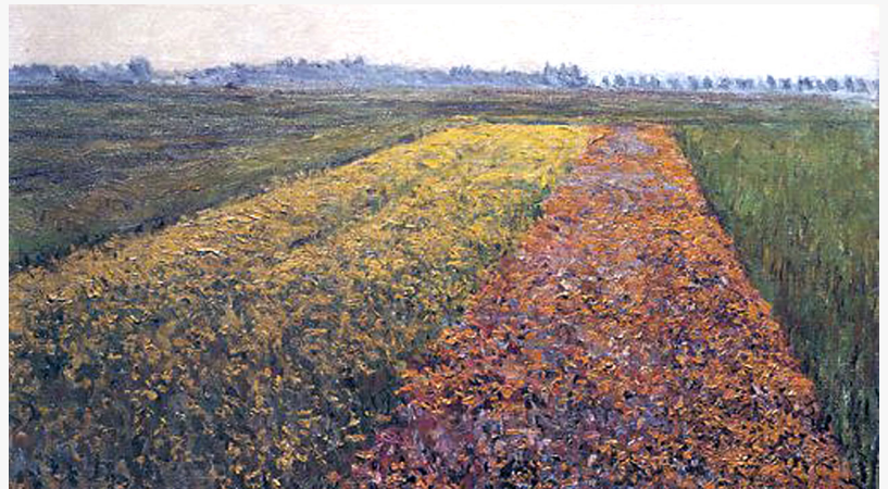
Best Real Estate Agents Little Elm Texas