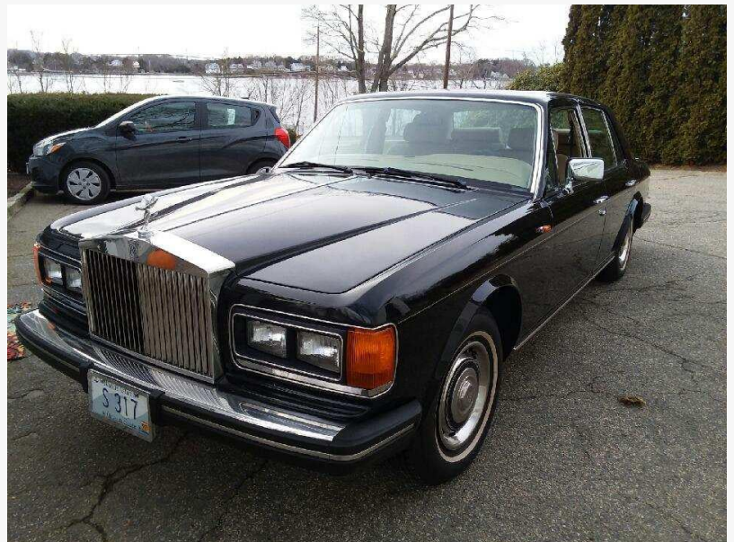
1985 Rolls Royce Silver Spirit car with just 35,000 original miles on the odometer, perfectly maintained, with an ivory colored interior with the finest burl wood inlays (est. 8,000-$12,000).