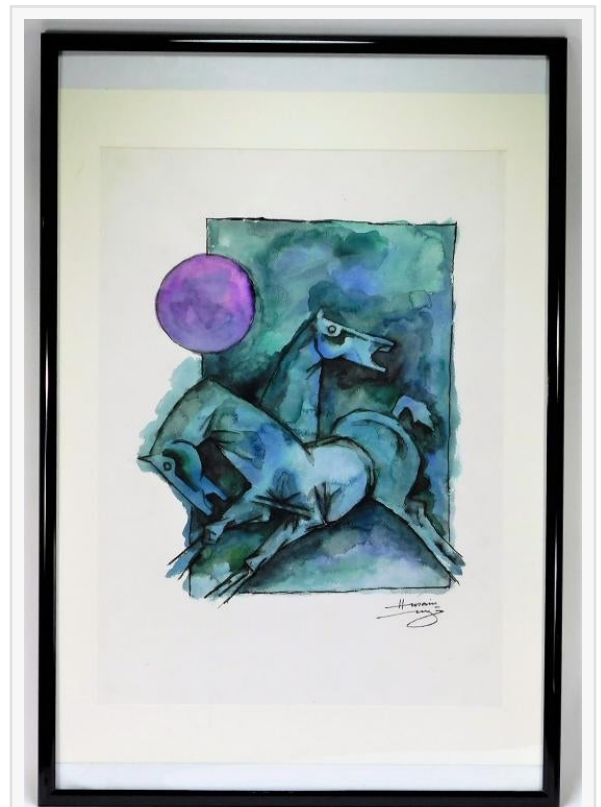
Watercolor painting by Maqbool Fida Hussain (India/England, 1913-2011), "the Picasso of India", a Cubist figural rendering depicting two galloping blue horses (est. $15,000-$20,000).