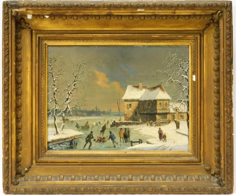
18th century or earlier Dutch winter wonderland painting, from the circle of Pieter Brueghel the Younger (1564-1636) or Hendrick Avercamp (1585-1634), faintly signed (est. $1,000-$2,000).