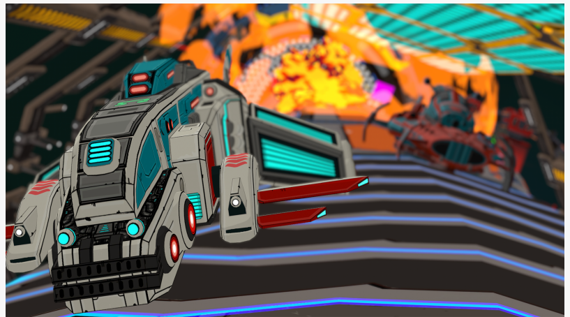
Radial-G Proteus - Intense Oculus Quest Racer