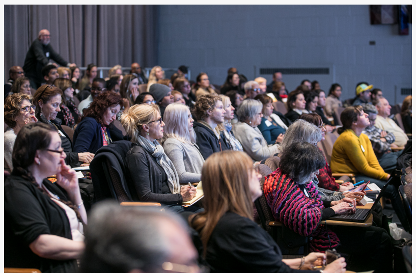
Audience at 2019 ICare4Autism Conference