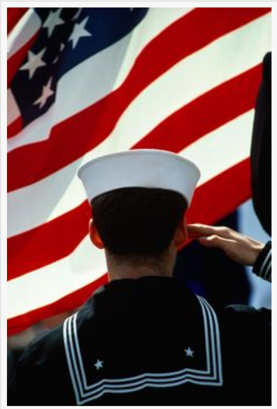
US Navy Veteran 21

Individuals in the state of Nebraska with mesothelioma could have been exposed to asbestos while serving in the US Navy or while working at a power plant, as a plumber, a boiler technician, as an auto repairman, as an electrician, or in the construction industry. In most cases, the