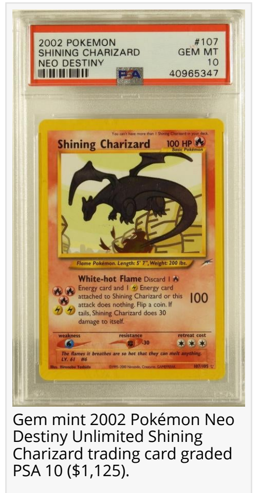
Gem mint 2002 Pokémon Neo Destiny Unlimited Shining Charizard trading card graded PSA 10 ($1,125).

Travis Landry Bruneau & Co. Auctioneers +1 401-533-9980 email us here