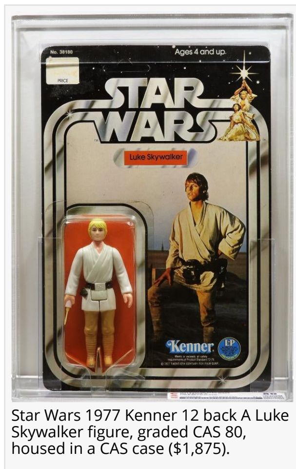
Star Wars 1977 Kenner 12 back A Luke Skywalker figure, graded CAS 80, housed in a CAS case ($1,875).

Tops in the comic book category was a copy of Reform School Girl (1951) from Avon Realistic Comics, which sold for $3,438. The book, in a CGC case and graded CGC 3.0 with white pages, was featured in Frederic Wertham's Seduction of the Innocent. It had a classic photo lingerie