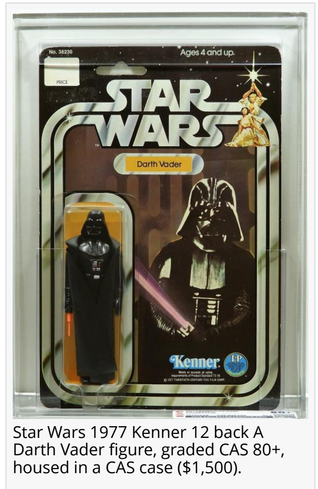
Star Wars 1977 Kenner 12 back A Darth Vader figure, graded CAS 80+, housed in a CAS case ($1,500).

This press release can be viewed online at: http://www.einpresswire.com