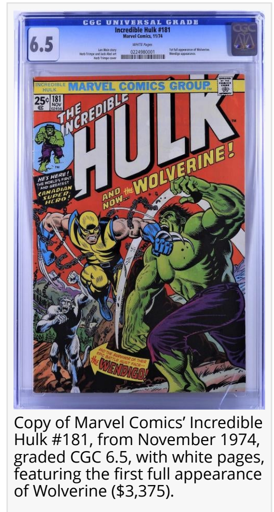
Copy of Marvel Comics' Incredible Hulk #181, from November 1974, graded CGC 6.5, with white pages, featuring the first full appearance of Wolverine ($3,375).

To learn more about Bruneau & Co. Auctioneers and the Saturday, January 4th auction, please visit www.bruneauandco.com . Updates are posted frequently.