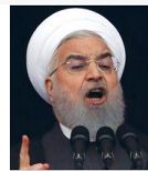
Hassan Rouhani Regime's President