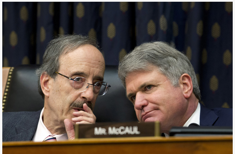
Elliot Engel and Michael McCaul, chair and ranking members of the House Foreign Affairs Committee key backers of H.Res.752

The bi-partisan House Foreign Affairs Committee resolution was amended and passed not long after the onset of the November uprising which spread to 191 cities in all of Iran's 31 provinces. Following the regime Supreme Leader Ali Khamenei's shoot-to-kill order, the security forces massacred more than 1,500 protesters - 520 of whom have been identified by the Iranian Resistance so far. Nevertheless, this uprising, "the most significant anti-government protests in Iran since June 2009," shook the religious dictatorship to its foundations and is a major step towards its eventual downfall. "The uprising's gains are irreversible; no matter how deep or wide the state suppression," NCRI U.S. Rep. said.