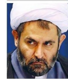
Mullah Hossein Taeb Head of IRGC Intelligence Org