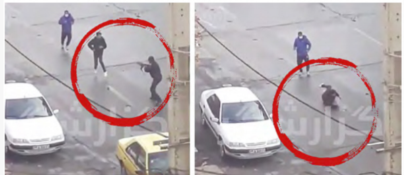
Images captured from a harrowing film shows an SSF agent shooting a protester from close range.

NCRIUS released a 91 page book on Iran uprising with names of 92 perpetrators of the killings