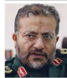
Gholamreza Soleimani Commander of Basij Force