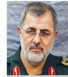
Mohammad Pakpour Ground Forces Commander of IRGC