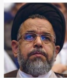
Mullah Mahmoud Alavi Intelligence Minister