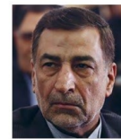
Alireza Avayi Justice Minister