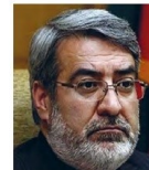
Abdolreza Rahmani Fazi Interior Minister