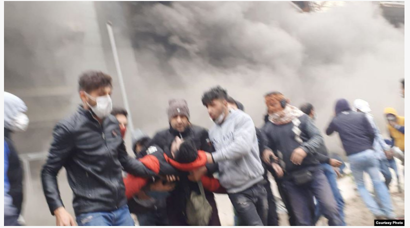
Protesters carrying away a wounded youth who was shot during anti-regime protests in Shiraz, Fars Province, Iran. November 17, 2019

This press release can be viewed online at: http://www.einpresswire.com