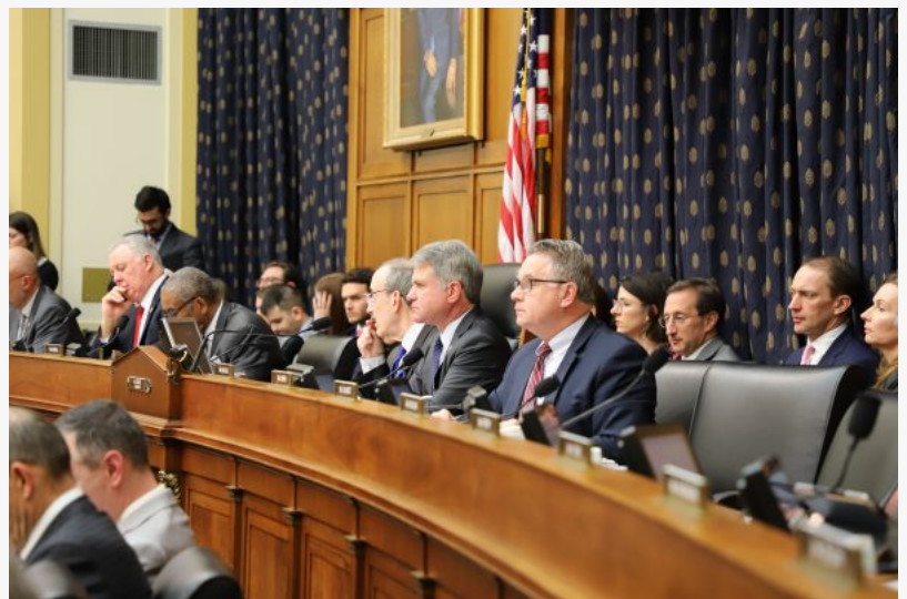
House Foreign Affairs Committee Voting on H.Res.752