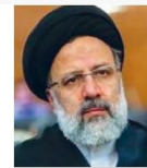
Mullah Ebrahim Raisi Chief Justice