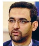
Mohammad-Javad Azari Jahromi Minister of Information and Communications Technology