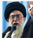
Ali Khamenei Regime's Supreme Leader

Several members of the IRGC, some in plainclothes, firing at an unarmed protester in northern city of Gorgan at point blank range, while another attacking him with an axe