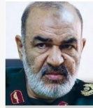
Hossein Salami Commander-in-chief of IRGC