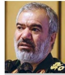
Ali Fadavi Deputy Chief of IRGC