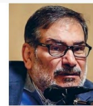
Ali Shamkhani Secretary of SNSC