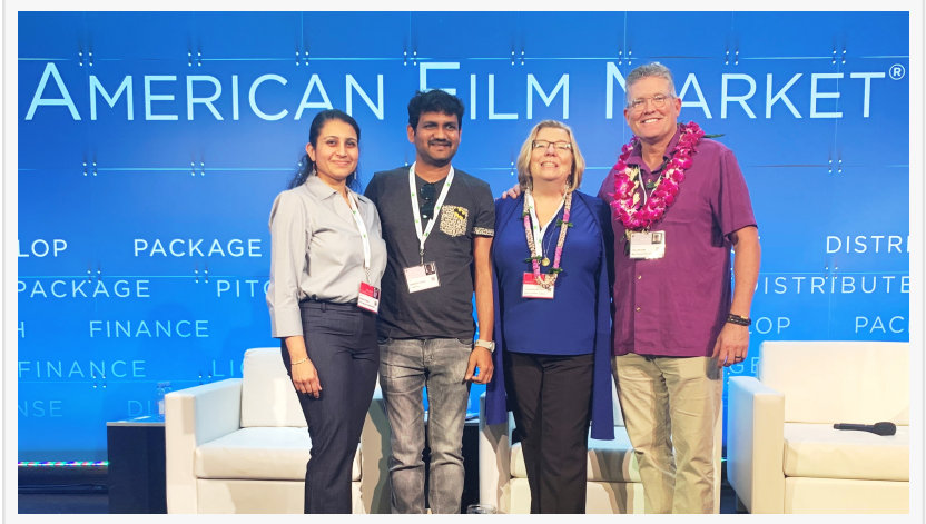
Collaboration with Hawaii Film Commission

This press release can be viewed online at: http://www.einpresswire.com