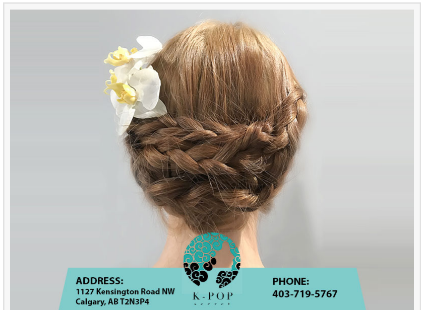
K-Pop Secret Beauty Studio Calgary Hairstyles