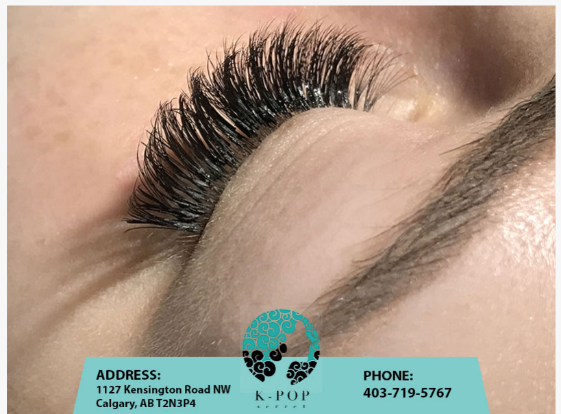
K-Pop Secret Beauty Studio Calgary Eyelashes

This press release can be viewed online at: http://www.einpresswire.com