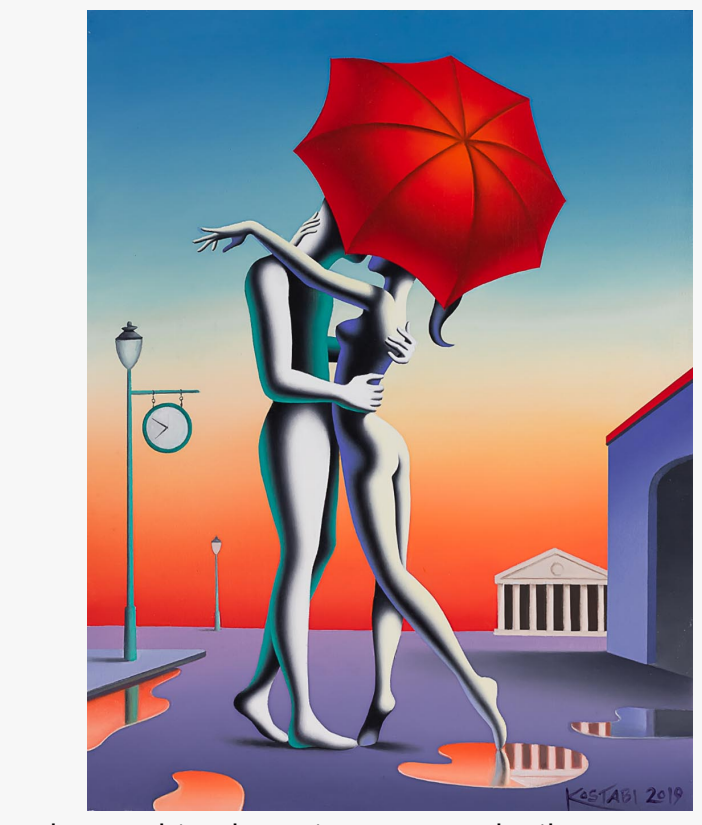
Mark Kostabi, When Time Stopped, oil on canvas

Kostabi's work has been featured in The New York Times, People, Vogue, Playboy, Forbes, New York Magazine, Art Forum and Art in America. Retrospective exhibitions of Kostabi's paintings have been held at the Mitsukoshi Museum in Tokyo (1982), the Art Museum of Estonia in Tallinn (1998), and at the Chiostro del Bramante in Room in 2006. It is proudly displayed in over 50 permanent museum collections, including the Museum of Modern Art, The Metropolitan Museum of Art, the Guggenheim Museum, the Brooklyn Museum, The National Gallery in