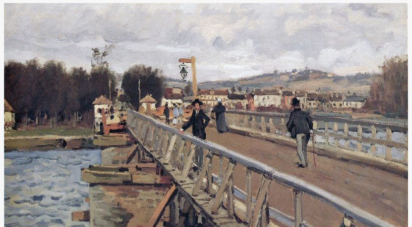
Best Real Estate Agents Livermore California