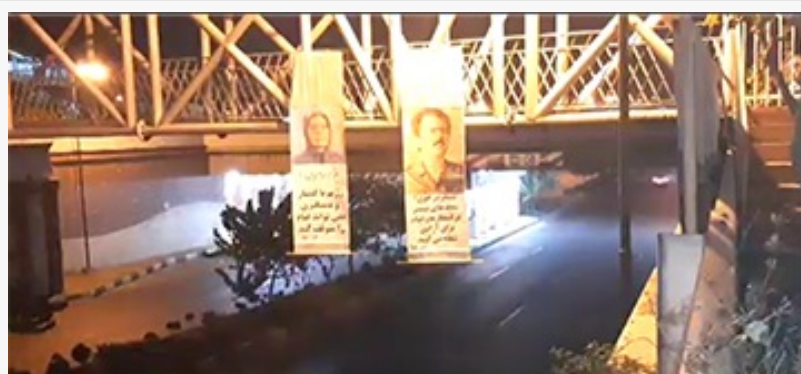
Tehran – Saeedi Expressway, Dec. 1, 2019, the two posters are, Massoud Rajavi: "More flames on the way. Uprising for freedom is ablaze." Maryam Rajavi: "Regime cannot stop the uprising with killings and arrests."

December 22 and 23: Resistance Units placed messages and portraits of Mrs. Maryam Rajavi and Mr. Massoud Rajavi in various parts of Tehran (Imam-Ali Expressway, Nezam Abad, Sattar Khan, and Marzadaran). Some of the banners read, "Hail to the martyrs from Shahriar to Karaj, Sirjan, Behbahan, Shiraz, Marivan, Khorramshahr, Tehran and other cities," and "The blood of martyrs has strengthened the resolve for uprising and rebellion in Iran."