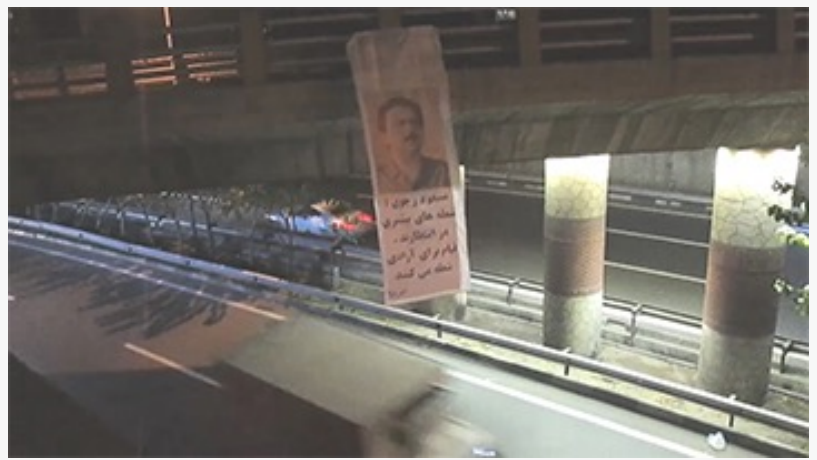
Tehran – Police Expressway, Massoud Rajavi: "More flames on the way. Uprising for freedom is ablaze."