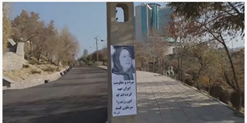
Tabriz – Pars Hotel Maryam Rajavi: "Iranian people and Resistance have pledged to overthrow this regime."

December 8: Resistance Units posted pictures and messages of Mrs. Maryam Rajavi and Mr. Massoud Rajavi in different parts of Tehran, including Tavanir Bridge and the University of Agriculture. On the day before, Tehran and Sharif Industrial universities and other parts of the capital had been scenes of similar activities.