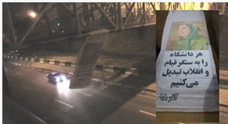
Tehran – Imam Ali Expressway, Dec. 7, 2019 Maryam Rajavi: "We will turn every university into a bastion of uprising and revolt."