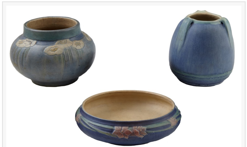
A fine selection of Newcomb Pottery will include pieces by Sadie Irvine.