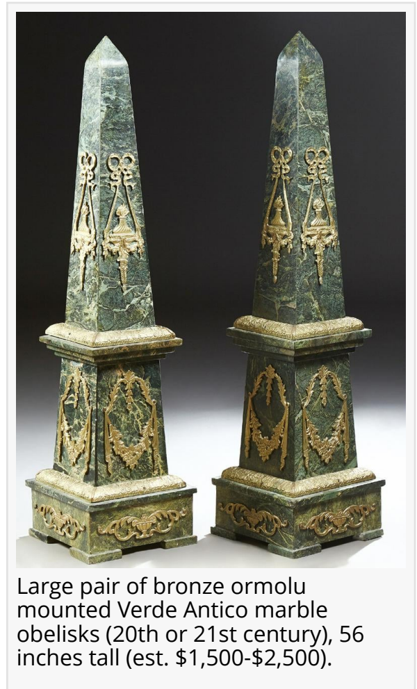
Large pair of bronze ormolu mounted Verde Antico marble obelisks (20th or 21st century), 56 inches tall (est. $1,500-$2,500).