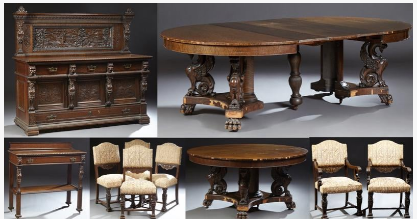
Nine-piece carved oak dining room suite in the style of R.J. Horner consisting of a server, a sideboard, six upholstered chairs and a dining table with four leaves (est. $4,000-$8,000).

The nine-piece carved oak dining room suite in the style of R.J. Horner consists of a server, a sideboard, six upholstered chairs, a dining table with four leaves, 108 inches wide when open (est. $4,000-$8,000). The oil on board painting by Clementine Hunter, titled Baptism (circa 1950), is signed lower right and measures 17 ½ inches by 23 ½ inches (est. $3,000-$5,000).