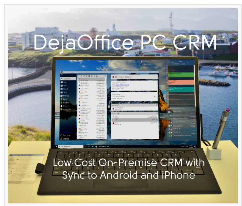
DejaOffice PC CRM - Affordable On-Premise CRM with Android and iPhone Sync

DejaOffice PC CRM Pro sells as a 5-user license for $199. 95, or $40 per user at a one-time price. Each user can have a unique login and can password their login. Contacts, Calendar, Tasks and Notes can be assigned to a co-worker or unassigned and visible to everyone. Any user can see their own Calendar, or can view all Calendars. When a Contact or Event is private, only the logged in user will see it.