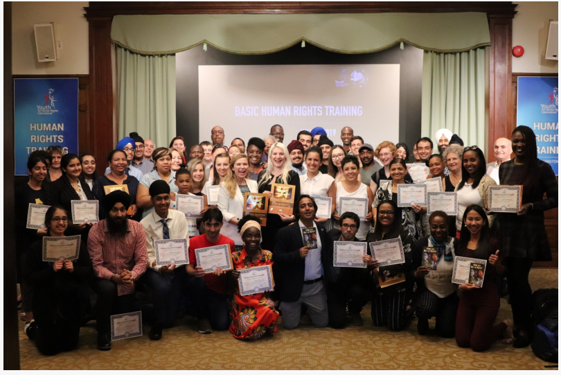
Attendees receive certificates of participation at the end of the trafficking awareness training.