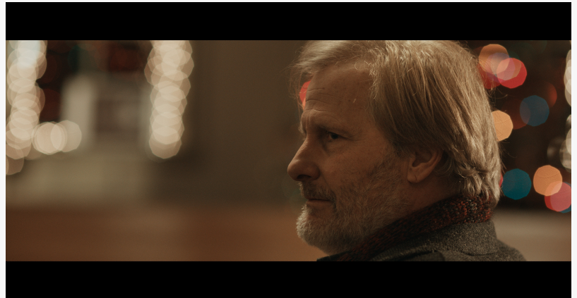
Best Actor to Jeff Daniels starring in the film Guest Artist