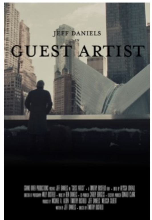
Best Director to Timothy Busfield for "GUEST ARTIST"