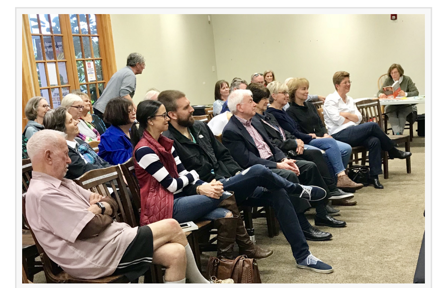
Ageless Authors events are popular among audiences of all ages.

will read their work from the hot-off-the-press collection of 34 stories and poems all penned by seniors. They will sign books and answer questions from aspiring writers such as how to get started on a writing project, how to make your characters come alive and how to write dialogue.