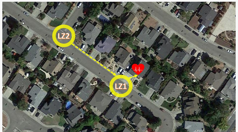
Jump Aero: Example landing zone schematic for suburban cardiac event response

PETALUMA, CALIFORNIA, USA, January 7, 2020 /EINPresswire.com/ -- Founded by experienced aviation entrepreneurs, Jump Aero's mission is to leverage electric vertical takeoff and landing (eVTOL) aircraft technology to cut emergency response times in half. Jump Aero's launch product will safely carry first responders to the scene of an emergency at top speeds in excess of 200 mph and be capable of landing on a typical suburban street. The founding leadership team consists of MIT-trained founders of Terrafugia, Still Water Design, and the Community Air Mobility Initiative. Initial funding for Jump Aero comes from angel investors with deep experience in the aviation industry.