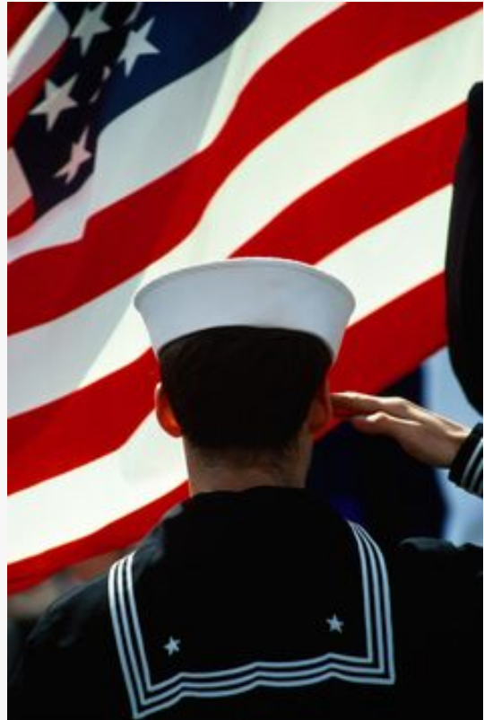
US Navy Veteran 21

About one third of all US citizens diagnosed with mesothelioma each year are Veterans of the US Navy. Before a Navy Veteran with mesothelioma or their family retain the services of a lawyer or law firm, they are urged to call the US Navy Veterans Mesothelioma Advocate anytime at 800-714-0303. https://USNavyMesothelioma.Com