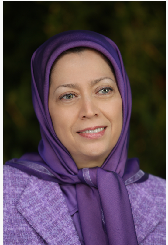
Maryam Rajavi, NCRI President-Elect