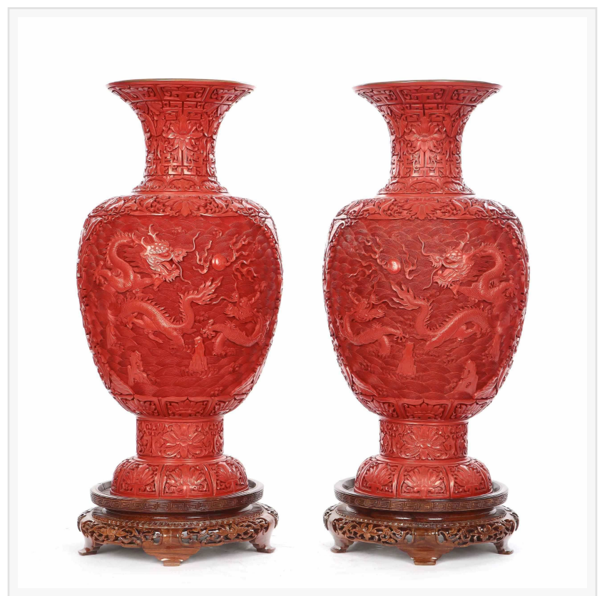
Pair of modern Chinese cinnabar lacquer style vases, each raised on a carved hardwood stand, 24 ¾ inches tall (est. $2,000-$3,000).

The DTLA Collections and Estates auction on Sunday, January 26th, at 10:30 am Pacific time, is where folks will find different, fun, quirky and out-of-the-ordinary accessories and furnishings, as well as luxe décor and statement pieces for the home, loft, gallery and retail space. Interior designers will be able to re-design a room or an entire home in an affordable, sustainable way.