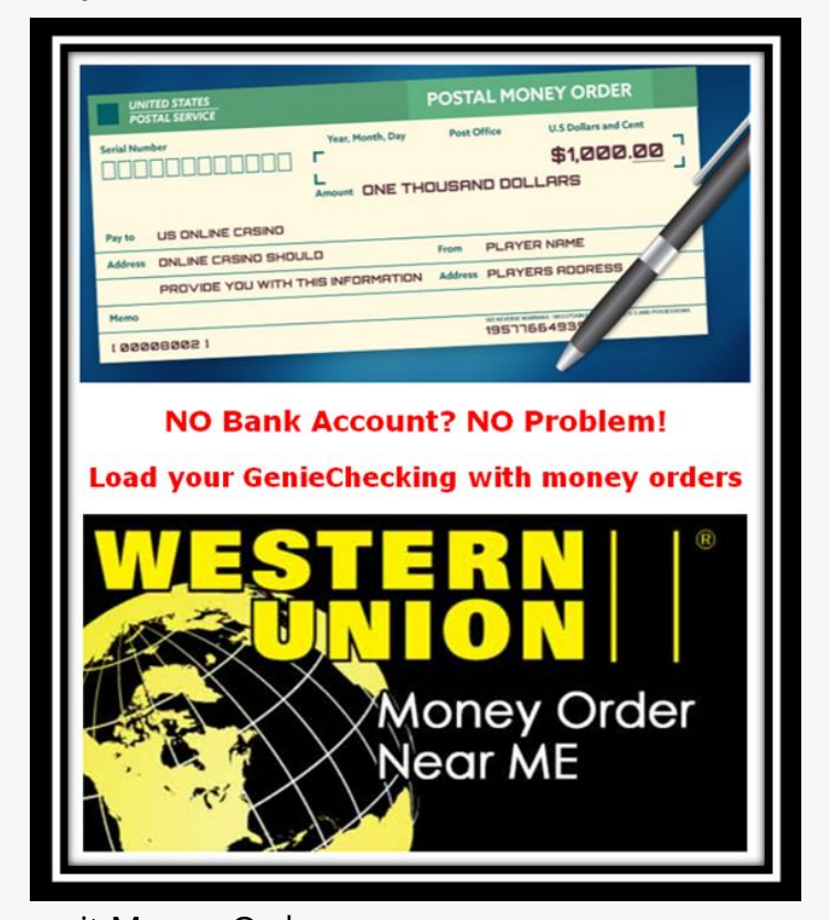
Deposit Money Orders

given transaction. From face-to-face in store, through cell phones and tablets all the way to watching TV, we have it covered."