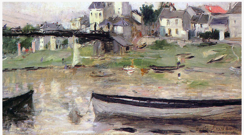
Best Real Estate Agents Antioch California