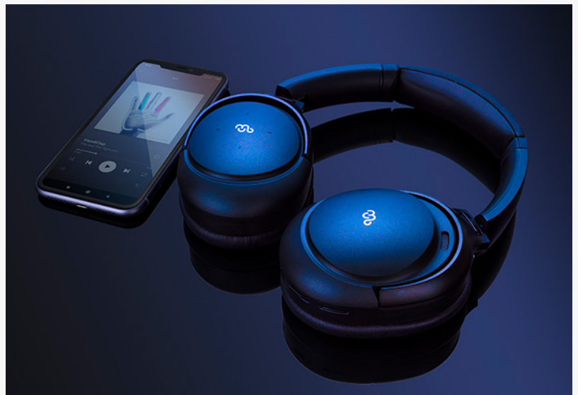
Mu6, Make your life sound better!