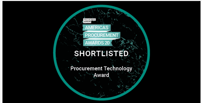
Mintec Shortlisted for Americas Procurement Award 2020

BOURNE END, BUCKINGHAMSHIRE, UNITED KINGDOM, January 8, 2020 /EINPresswire.com/ -- This comes following the launch of the Mintec Analytics platform into the North American market earlier in 2019. The SaaS-based platform provides procurement professionals with access to price data relating to over 14,000 raw materials as well as advanced analytical tools that deliver greater opportunity to control their spend.