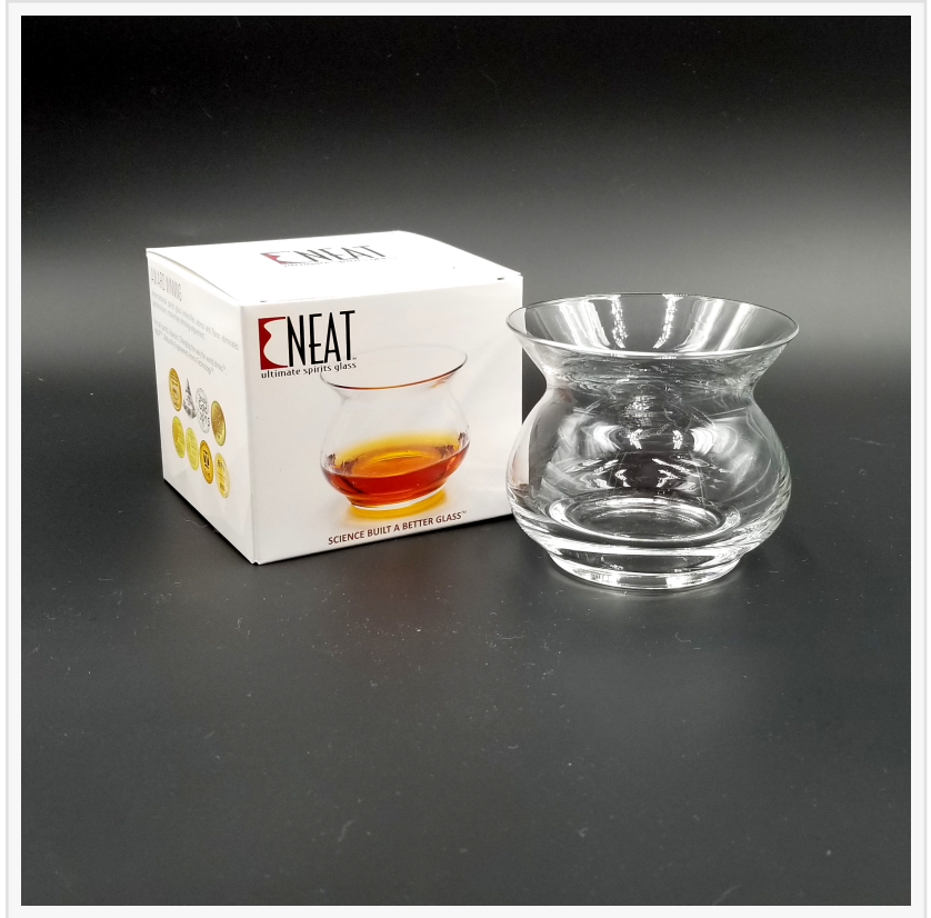
The NEAT Spirits Glass

The NEAT glass was chosen as the official glass for its exceptional delivery of aromas and enhanced flavor. Taste and aroma are the truest measure of a spirit's quality. Alcohol burn overwhelms the truth and numbs the nose, spoiling the experience. Over 10