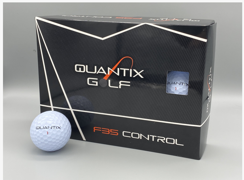
F35 Control Dozen