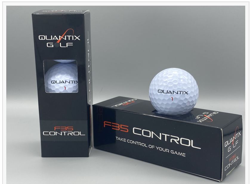
F35 Control Sleeve

Quantix Golf™ determined that most people have trouble off the tee due to excessive spin. One of the key features of the Quantix F35 Control™ golf ball is the ability to reduce spin off the tee which promotes longer and straighter drives, but that’s only one-third of the equation. Based on proprietary engineering, the Quantix F35 Control™ golf ball provides tour-level distance while maximizing control with irons and approach shots. No longer will you be forced you to sacrifice distance, accuracy, or feel, unlike some other brands that force you to choose one feature over another. The Quantix F35 Control™ golf ball will help you make more putts and lower your scores. The ideal feel that every player seeks, deserves and should demand from tee to fairway. Notwithstanding, it also translates to the green as the ball comes off the putter very well and provides instant feedback. Fewer putts mean lower scores!