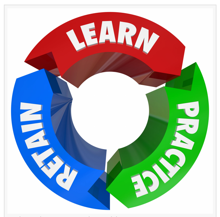
Onboard training tools enable a Learn-Practice-Retain cycle that is very effective for training custodians.

<u>KaiTutor</u> (Ref: Kaivac, Inc.) exemplifies this approach, as it provides simple how-to video that enables point-of-use field- and equipment-integrated training.