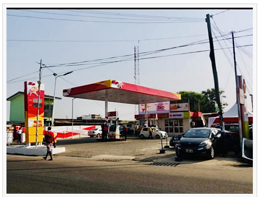
So Energy Retail Station Alabo, Accra Ghana

The new retail station will serve both private and commercial vehicles in Kotobabi, Alajo, Circle and other