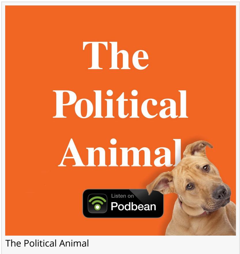
The Political Animal

The Political Animal podcast is a weekly segment that not only delivers timely information but offers insights and analysis you won't hear anywhere else. We'll offer in-depth discussions of local, state, or federal policy and elections, and the effects of laws and regulations on corporations. We hope you'll listen today, and also check out Episodes 4: Big Cats: Endangered in the Wild and In Danger as Captives in the United States, Episode 3: Michael Vick and the Continuing Battle Over Animal Fighting, about the renewed attention on convicted dog-fighter and NFL player Michael Vick and implementation of the latest animal fighting law, Episode 2: 2019 Shark finning, horseracing, and the PACT Act that includes a layered discussion of how the committee process works and why it's so difficult to even get a common-sense measures into