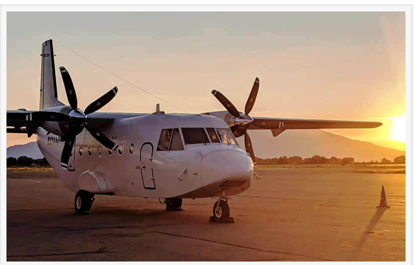
CASA 212 with Hartzell 5-Blade Propellers.

"The modern five-blade props replace original equipment Hartzell four-blade aluminum propellers, providing weight savings and more efficient aerodynamics resulting in quieter flight and higher performance, including takeoff distance, time to climb, and faster cruise speeds," said Texas