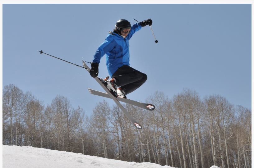
Nuke The Soup - Feed The Fire