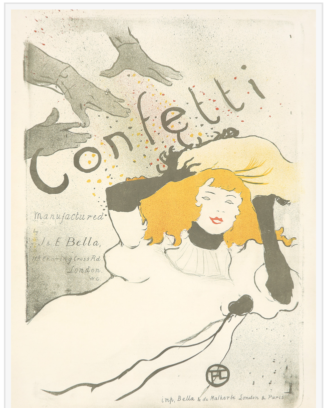
Lot 496. Confetti, 1894, by Henri de Toulouse-Lautrec (1864-1901).

30 more World War I posters are featured: mostly American designs, and all powerful. Of particular note are Christy's Gee!! I Wish I Were a Man (est. $1,400-$1,700) and several works by Flagg, including Wake Up, America! (est. $6,000-$8,000) and I Want You for U.S. Army (est. $5,000-$6,000).