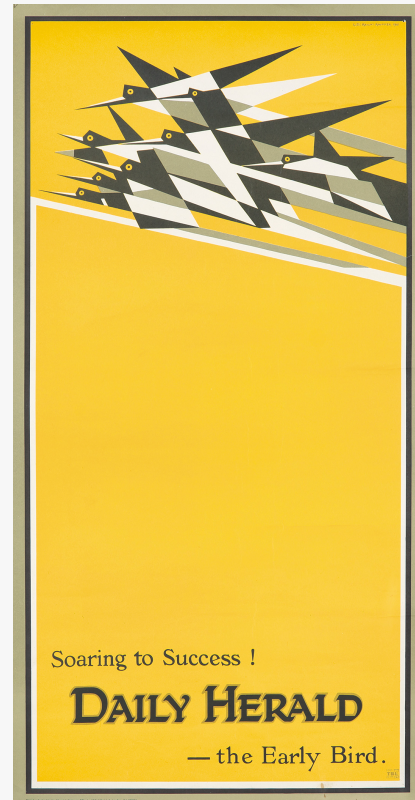
Lot 380. Flight / Daily Herald, 1918, by E. McKnight Kauffer (1890-1954).