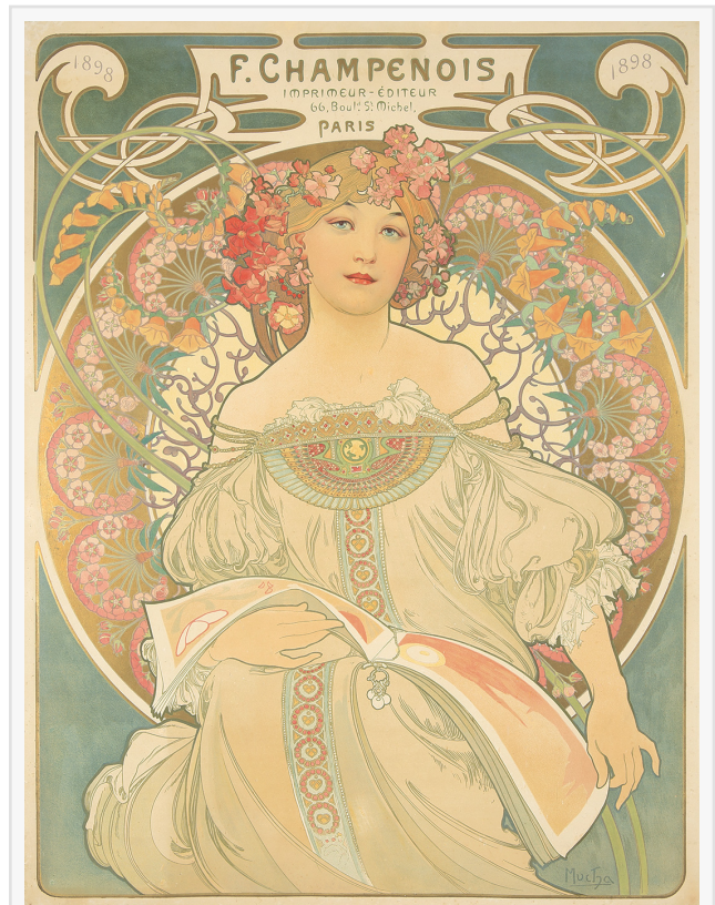
Lot 427. F. Champenois / Reverie, 1897, by Alphonse Mucha (1860-1939).