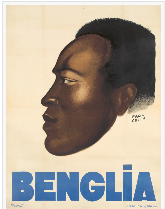
Lot 27. Benglia , 1928, by Paul Colin (1892-1986).

Further remarkable works include: Cassandre's Étoile du Nord (est. $17,000-$20,000), Dupas' Bal des Étudiants (est. $40,000-$50,000), Kauffer's Flight / Daily Herald (smaller format; est. $30,000-$40,000), Lauro's Trouville (est. $8,000-$10,000), Loupot's Plantol and PKZ / Burger-Kehl & C. (both est. $12,000-$15,000), and Schnackenberg's