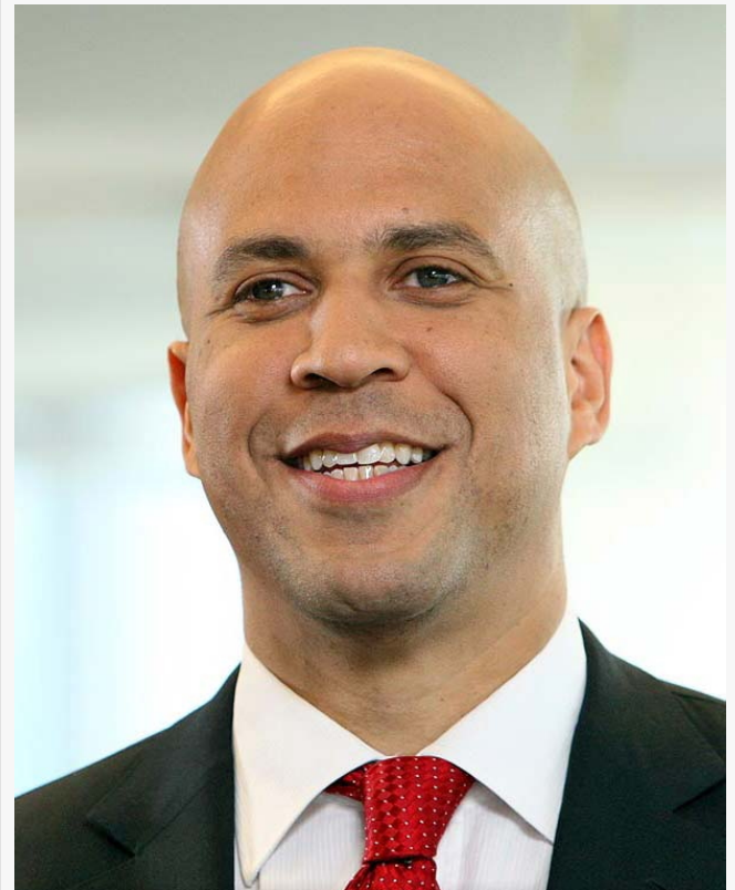
Senator Cory Booker