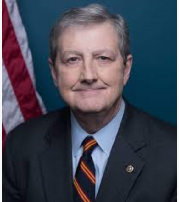
Senator John Kennedy