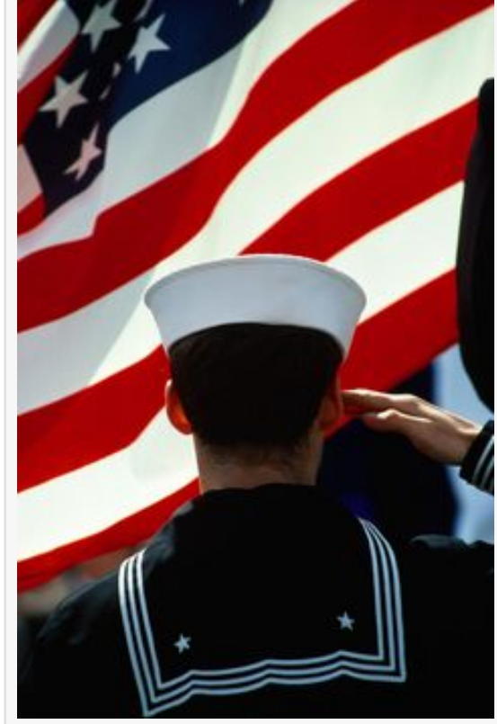
US Navy Veteran 21

following two heath care facilities with the offer to help a diagnosed victim, or their family get to the right physicians at each hospital.