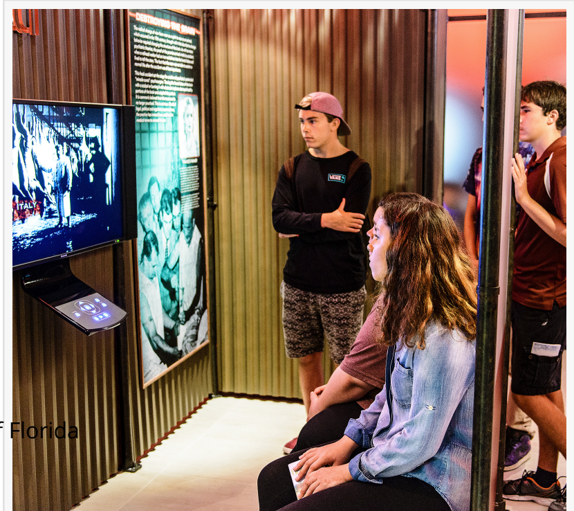
Visitors of the exhibit can view the documentary videos in multiple languages.