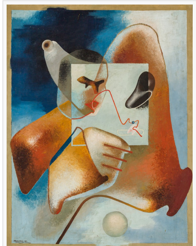
ENRICO PRAMPOLINI, Italian (1894-1956), Surrealist Composition, oil on panel, signed, 45 3/4 x 35 inches, Estimate: $8,000-12,000

An online catalog for this auction is available on www.shannons.com . Previews will be held daily,