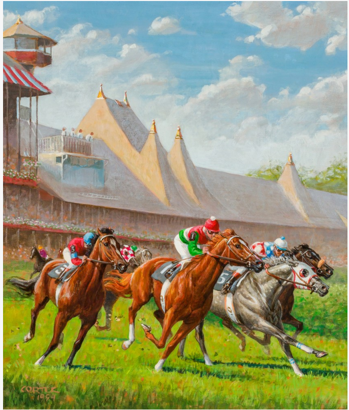
JENNESS CORTEZ, American (b. 1944), "Saratoga II," signed and dated, 14 x 12 inches, Estimate: $6,000-8,000

Sandra Germain Shannon's Fine Art Auctioneers +1 203-877-1711 email us here