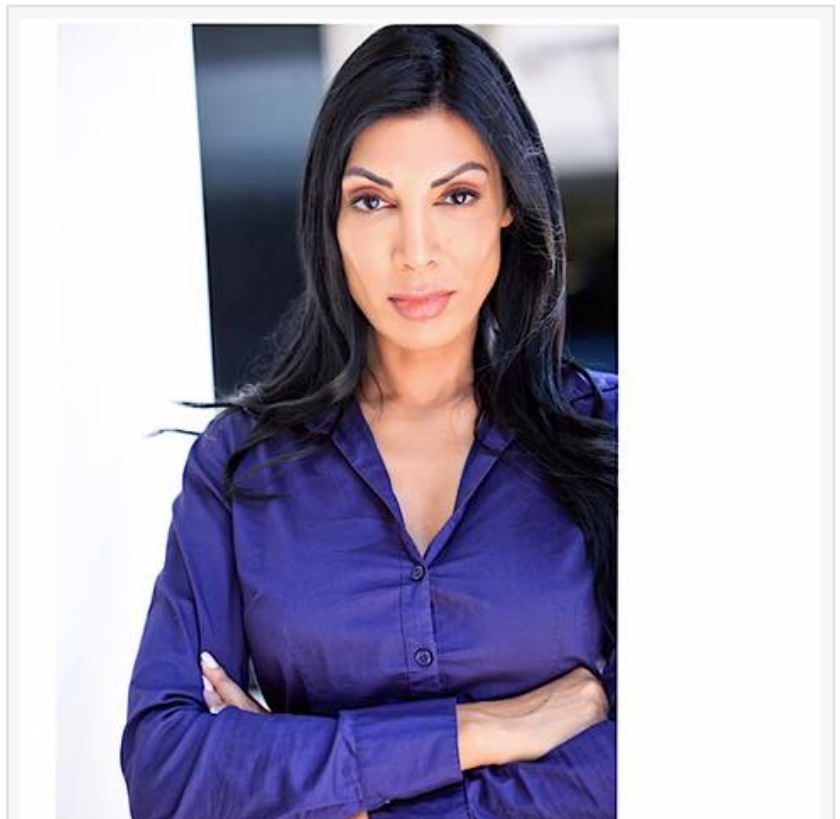
The Leader in 90s Shock Culture Jasmin St. Claire