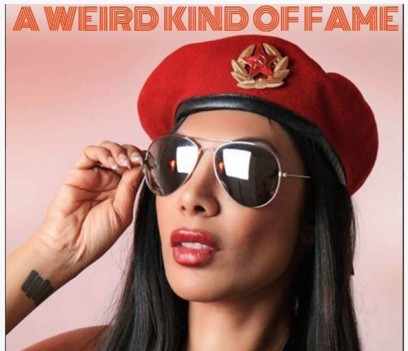
A Weird Kind of Fame Debuts This Saturday Night at Second City LA