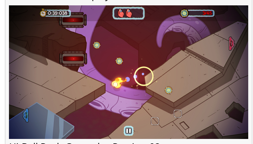
Hi-Ball Rush Gameplay Preview 02

Each one of us owns a smartphone, therefore a gaming console. Jyamma Games is determined to bring their over the top and ambitious productions to as many mobile phones as possibile, from hard-core to casual gamers - and they're doing it their own way.