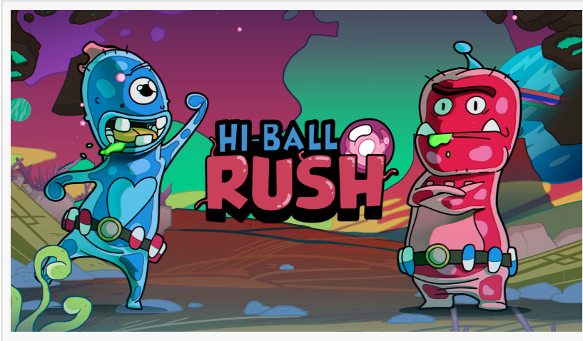
Hi-Ball Rush - Key Visual

Jyamma Games is set to addictively sneak - and stay - in your pocket.