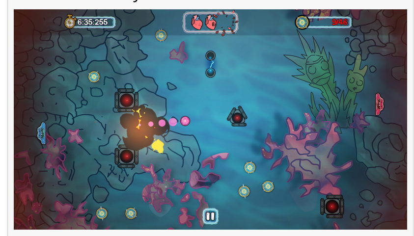
Hi-Ball Rush Gameplay Preview 01