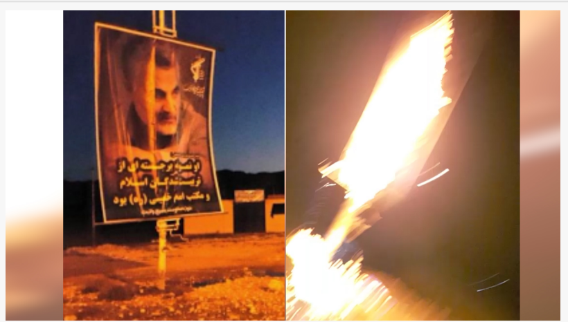
Iran - Fassa, Soleimani's picture burning