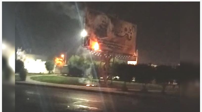
Iran - Shushtar, Soleimani's picture burning

This press release can be viewed online at: http://www.einpresswire.com