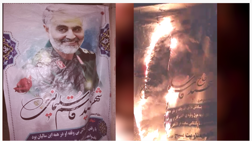
Iran - Iranshahr , Soleimani's picture burning

PARIS, FRANCE, January 17, 2020 /EINPresswire.com/ -- Today, January 17, 2020, on the same day when the regime's Supreme Leader Ali Khamenei was speaking at Tehran's Friday prayer congregation, defiant youth tore up or torched posters of the eliminated terror master Qassem Soleimani in different parts of Tehran and in other Iranian cities, including Kerman, Zanzan, Iranshahr, Fassa, Lahijan, Tabriz, Zahedan and Masjed Soleiman.