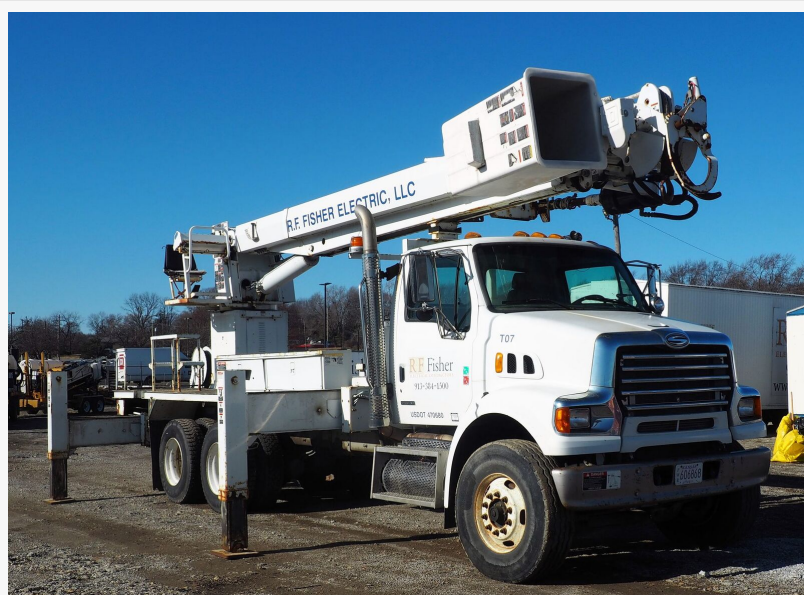
2008 Sterling boom truck.

KANSAS CITY, MO, UNITED STATES, January 20, 2020 /EINPresswire.com/ -- KANSAS CITY, MO. – Equipment, vehicles and supplies from the RF Fisher Electric Company – the venerable Kansas City firm that ceased operations late last year after more than 40 years as one of the top electrical subcontractors in the area – will be liquidated in three cataloged online auctions ending on February 11th, 12th and 13th by Mayo Auction & Realty. All bidding is through www.BidMayo.com .