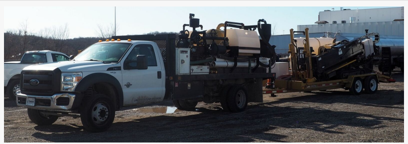
1013 F-550 Super Duty flatbed truck.