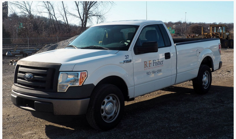
Ford F-150 trucks.