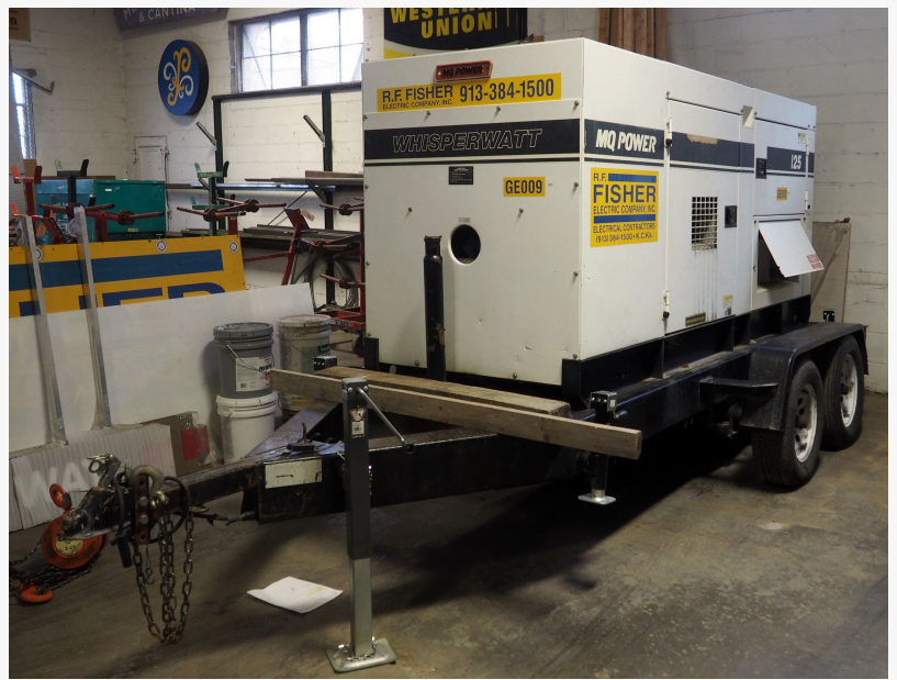
Multiquip Power Whisperwatt towable diesel generator.