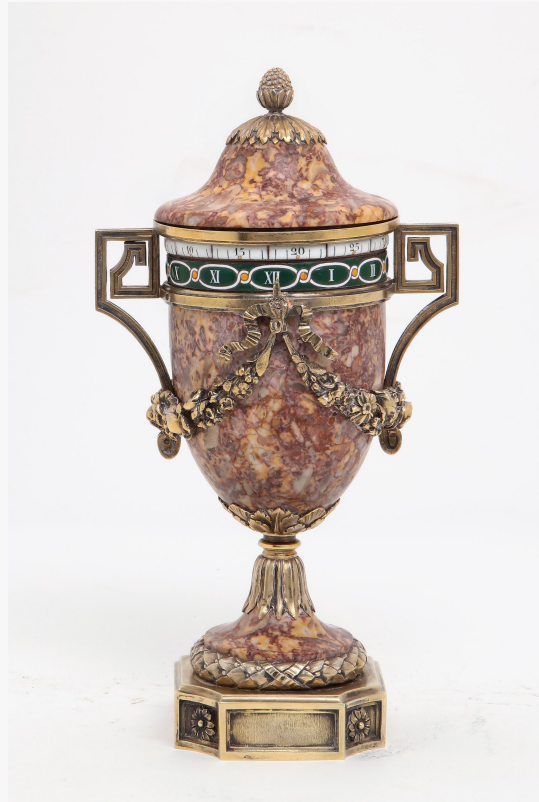
Cartier silver gilt mounted Spanish Brocatelle marble pendule à cercle tournant timepiece, circa 1905, 9 ¾ inches tall, width over handles 5 ¼ inches (est. $12,000-$18,000).

Andrew Jones Auctions' next major sale after this one will be a DTLA Collections & Estates auction on Sunday, March 22, also online and in the downtown Los Angeles gallery. Previews will be held Thursday thru Saturday, March 19-21, from 10 am until 5 pm Pacific time.