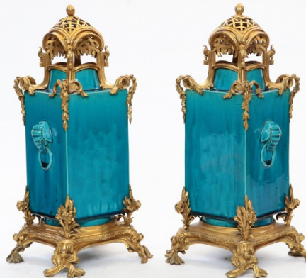
Pair of fine French gilt bronze mounted Chinese turquoise glazed porcelain potpourri vases and covers, with mounts attributed to Alfred Emmanuel Louis Beurdeley (est. $10,000-$20,000).