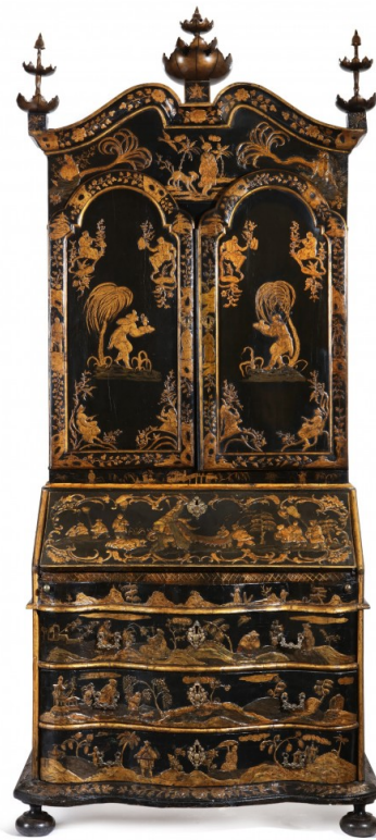
South German Baroque gilt and black japanned Chinoiserie decorated bureau cabinet, possibly Dresden, early 18th century and later, 98 inches by 42 inches (est. $20,000-$30,000).

The collection also includes several early Chinese pottery works and ceramics, led by two large Tang Dynasty models of warriors (est. $4,000-$6,000). By contrast, there is Untitled, 2000, a set of three glazed stoneware wall slabs by Jun Kaneko (Japanese, b. 1942) (est. $10,000-15,000). Also included is an impressive German Baroque gilt and black japanned Chinoiserie decorated bureau cabinet, possibly Dresden (est. $20,000-30,000). The decoration relates to the work of Martin Schnell (1685-1740) and pieces that he had made for palaces of Augustus the Strong.