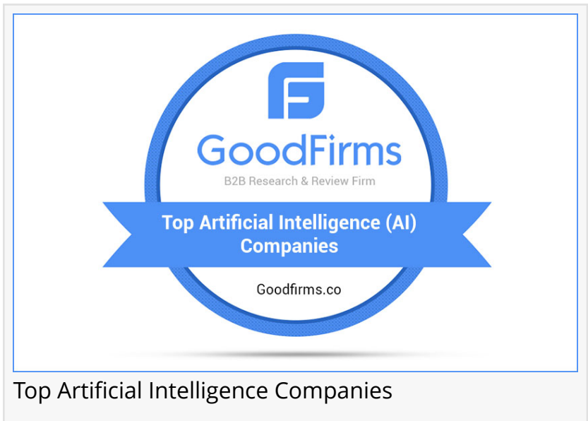
Top Artificial Intelligence Companies

numerous AI agencies in the market claims to be best. For the same reason, GoodFirms has unveiled the list of Top Artificial Intelligence Companies based on several research parameters.