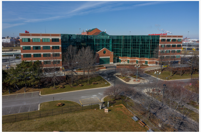
Crain's Headquarters at Brewery Park

2019 proved to be a successful year with over 400 processed applications, including 2 SD/VOBs