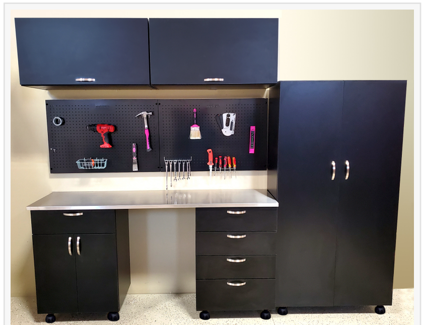
New Viper Tool Storage Complete Garage System delivered flat-pack and assembled with Lockdowel hidden fasteners.

"We are really excited to launch this flat-pack, complete storage solution that assembles in about 15 minutes," Brian Eastman President and Founder of Cala Industries, the makers of Viper Tool Storage, says. "With Lockdowel's slide-to-lock fastening technology and no show hardware, organizing your workspace for 2020 is more beautiful - and easier than ever!"