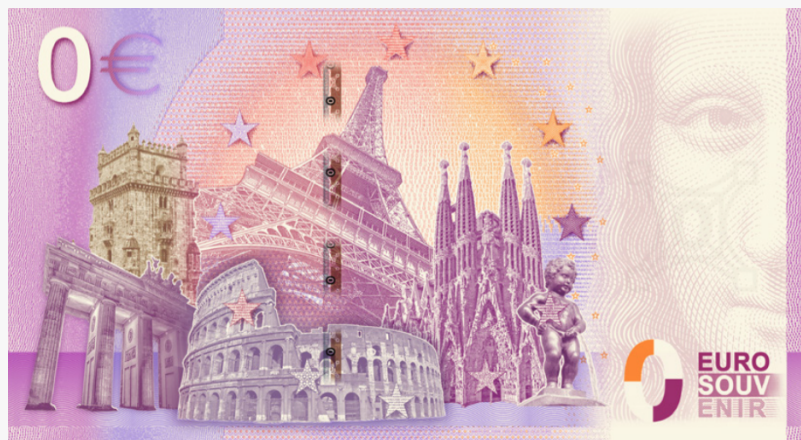
Back side of the 0 Euro note