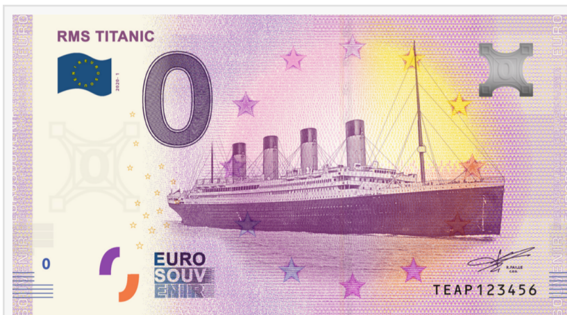
The first Irish 2020 Euro Souvenir banknote with the Titanic

The beautiful commemorative 0 Euro note is a popular collectible and wonderful gift. The Titanic notes can be pre-ordered from the company's website . Titanic fans, collectors, and Ireland enthusiasts will cherish the RMS Titanic 0 Euro note across the globe once it is released.