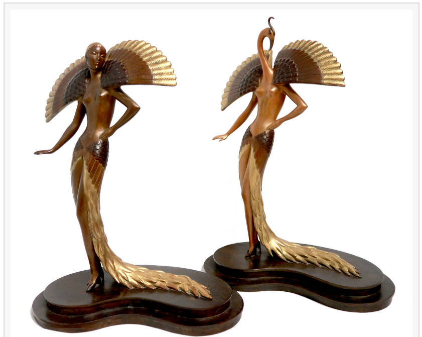
Very rare Ibis with head of a bird and drastically re modified Ibis

Brooke Trace North Beach Art Gallery +1 954-667-0660 email us here Visit us on social media: