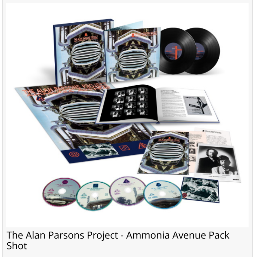
The Alan Parsons Project - Ammonia Avenue Pack Shot