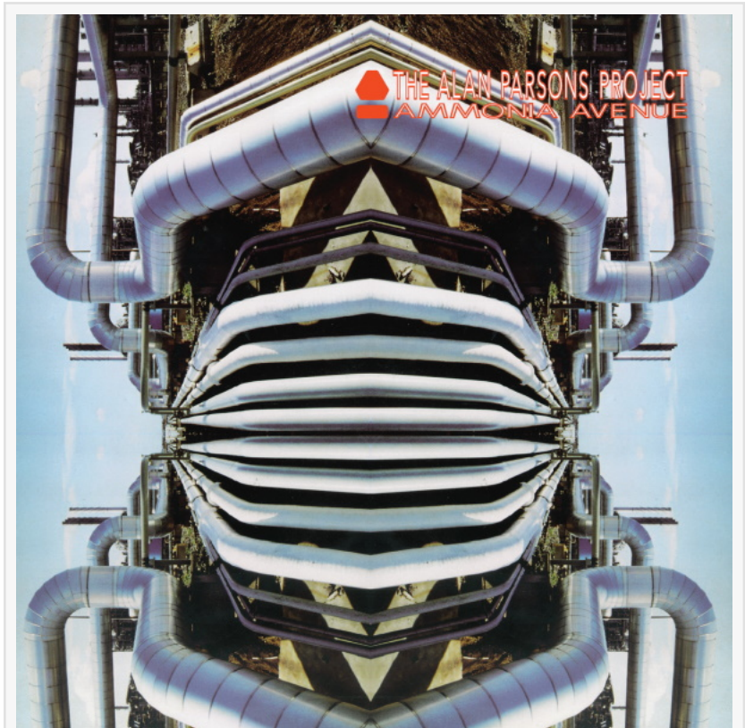
The Alan Parsons Project - Ammonia Avenue

Esoteric Recordings is proud to announce the release of a new re-mastered limited edition deluxe expanded boxed set of the classic album AMMONIA AVENUE by THE ALAN PARSONS PROJECT.