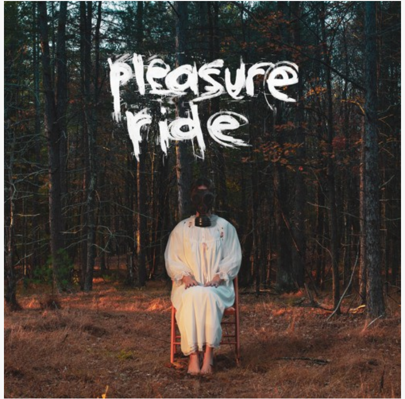
Ready, Steady, Die! - Pleasure Ride