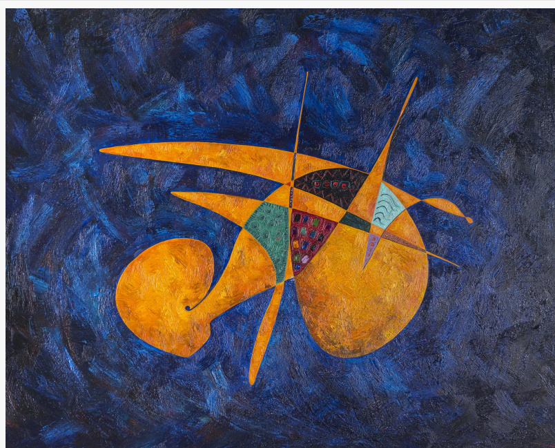
Umm Kulthum Bint Muhammad (2017)